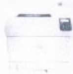
HP LaserJet Enterprise M606dn

Propel business results and produce outstanding print quality. Tackle large jobs and equip workgroups for success—wherever business leads. Easily manage and expand this ultra-fast, versatile printer—and help reduce environmental impact.