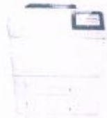
HP LaserJet Enterprise M606x

© 2014 Hewlett-Packard Development Company, L.P. All rights reserved. HP, the HP logo, HP LaserJet, HP LaserJet Enterprise, HP LaserJet Enterprise M606, HP LaserJet Enterprise M606dn, HP LaserJet Enterprise M606x, HP ePrint, HP eDiscovery, HP eEfficient, HP Planet Partners, and the HP Planet Partners logo are trademarks or registered trademarks of Hewlett-Packard Development Company, L.P. in the United States and other countries. All other trademarks are the property of their respective owners. HP, the HP logo, HP LaserJet, HP LaserJet Enterprise, HP LaserJet Enterprise M606, HP LaserJet Enterprise M606dn, HP LaserJet Enterprise M606x, HP ePrint, HP eDiscovery, HP eEfficient, HP Planet Partners, and the HP Planet Partners logo are trademarks or registered trademarks of Hewlett-Packard Development Company, L.P. in the United States and other countries. All other trademarks are the property of their respective owners. HP, the HP logo, HP LaserJet, HP LaserJet Enterprise, HP LaserJet Enterprise M606, HP LaserJet Enterprise M606dn, HP LaserJet Enterprise M606x, HP ePrint, HP eDiscovery, HP eEfficient, HP Planet Partners, and the HP Planet Partners logo are trademarks or registered trademarks of Hewlett-Packard Development Company, L.P. in the United States and other countries. All other trademarks are the property of their respective owners.